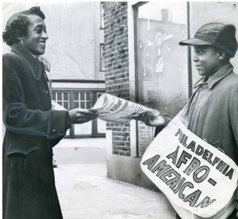
Archival photo - Courtesy of The Afro-American

Anyone who has been following the plight of local newspapers in recent decades knows the statistics. Newspaper jobs have fallen