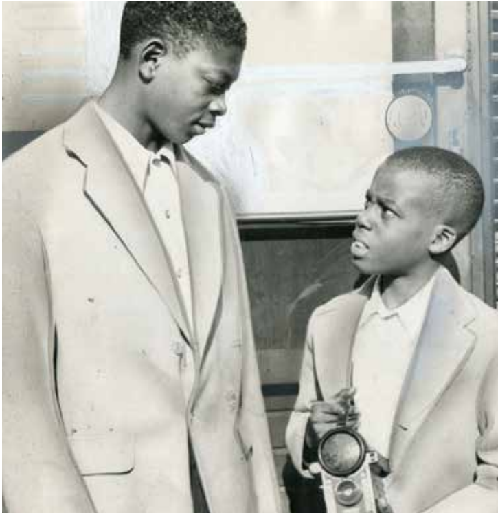
Archival photo - Courtesy of The Afro-American

We also must try to save those smaller hyperlocal publications that truly have the pulse of local communities. Because the more good media we have, the better it is for our news ecosystem and of our democracy.